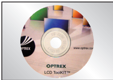
Quick Set-Up and Document CD-ROM