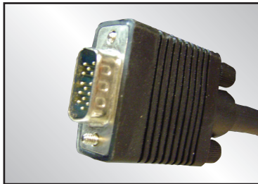
VGA (Analog RGB) Cable