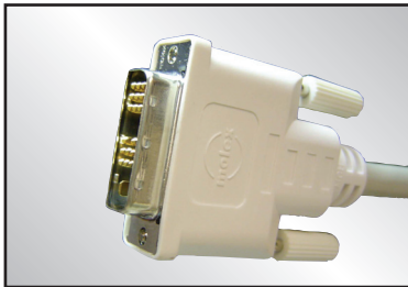
DVI (Digital) Video Cable