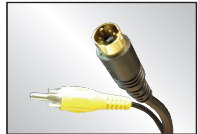
S-Video & Composite-Video Cables