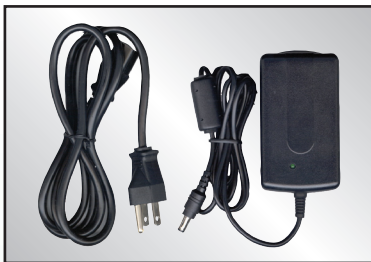
12V DC Power Supply